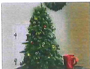
Classic Tabletop Tree