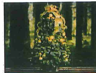
Golden Elegance Tree